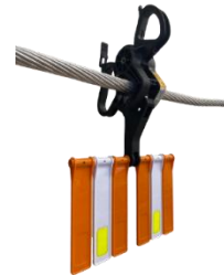
Figure 3 BD-SC-1Z-RW-BE

Suitable for powerline warning around construction sites