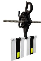
Figure 2 BD-SC-1Z-OW-BE

Suitable for powerline warning for birds