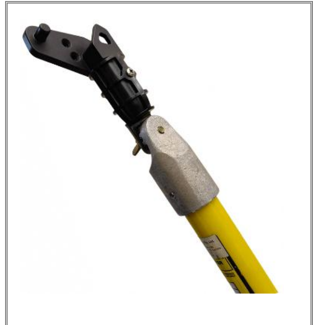
Figure 1 LLCR-K-BE